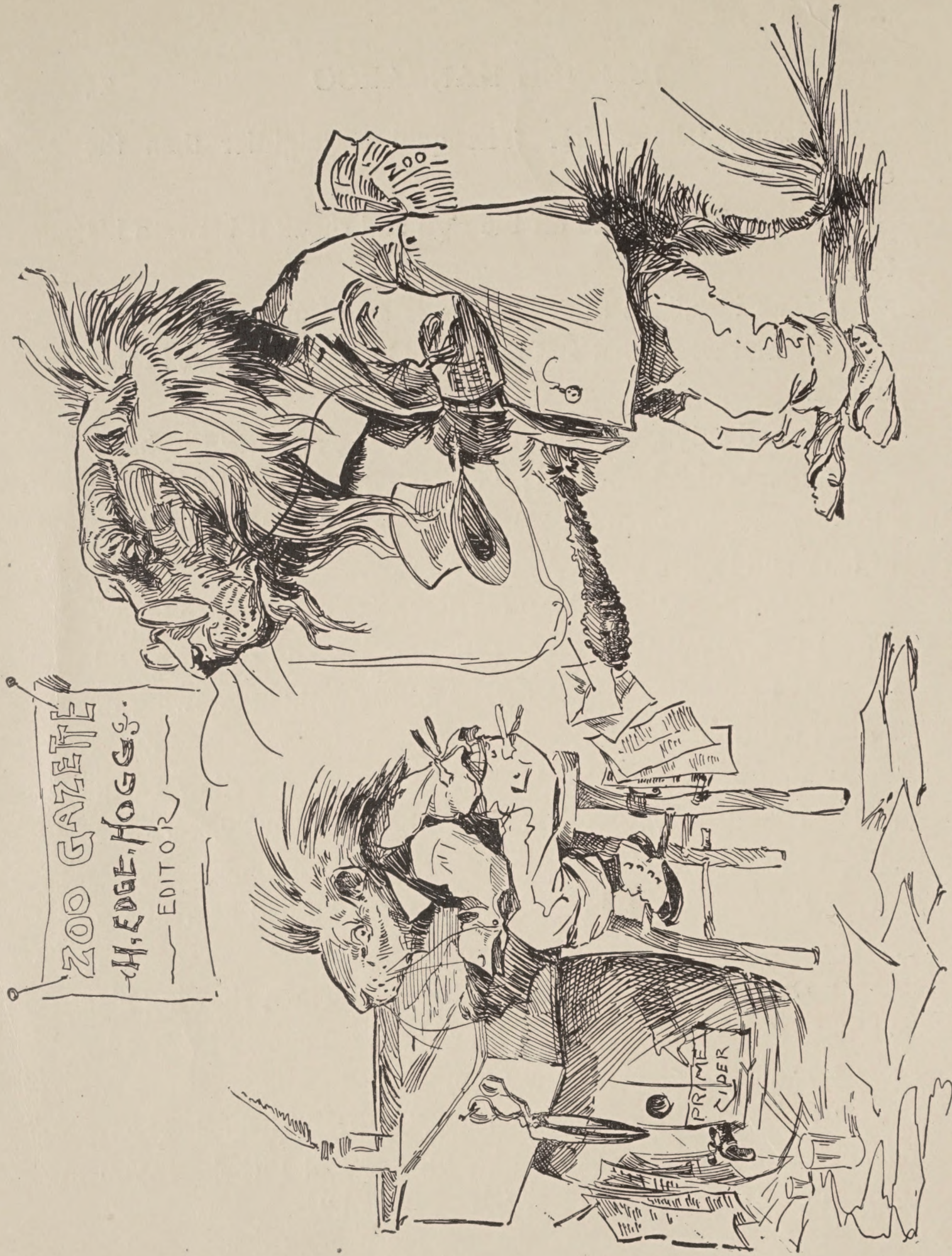
HEDGEHOG WRITING AT HIS DESK.